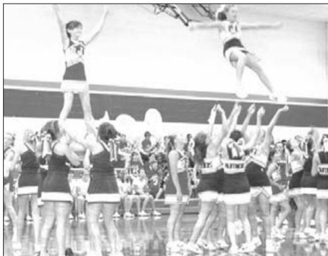
HOMEcomings CHEER - At top left, the middle school cheerleaders show some acrobatics during the BMS pep rally last Thursday. Above right, the BHS and BMS cheerleaders performed together and are shown posing at the end of a routine during the high school pep rally on Friday afternoon.

Both teams will play at home this week as Center.