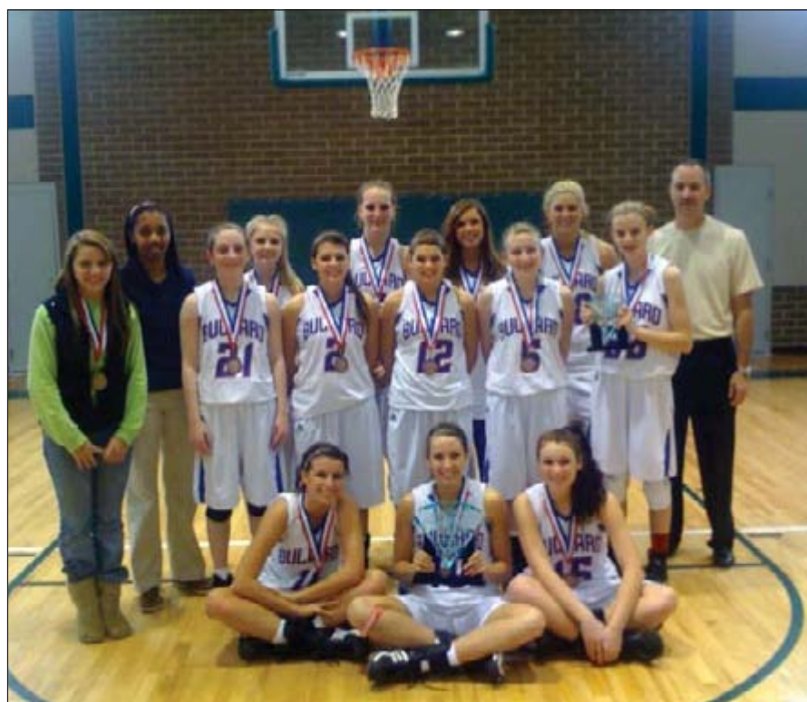
The Bullard Lady Panther basketball team recently won the McDonald's Brazos Valley All-Star Invitational in Bryan, defeating several state-ranked teams in the process. See scores and related stories on Page 8.