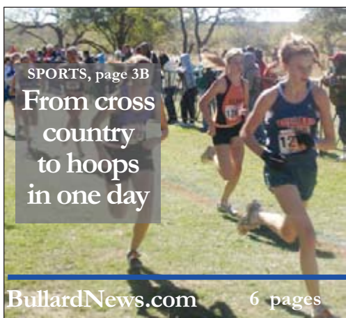
SPORTS, page 3B From cross country to hoops in one day