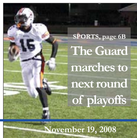
SPORTS, page 6B The Guard marches to next round of playoffs