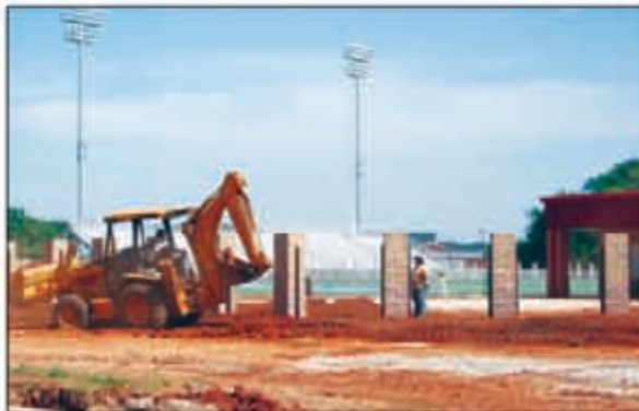
Construction on the football stadium continues, a dedication of the field should be the night of the first home game.

Also, the Intermediate school is being remodeled and adding a library, offices and three classrooms.