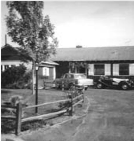
Chiarenza family homestead in Garden Grove, 1962.