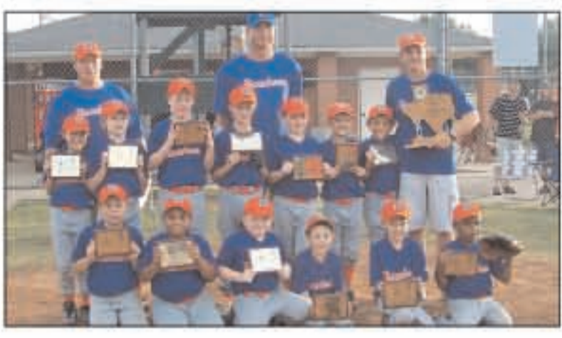
The Bullard Bombers, along with their coaches, celebrate their runner-up status at the recent state championship game.